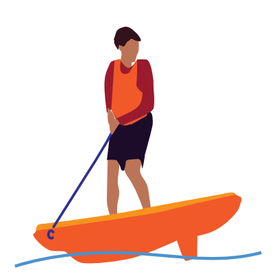
TURN BY SLIGHTLY MOVING FEET ON THE DECK.

CONTINUE TO SHIFT WEIGHT FROM LEFT TO RIGHT. THE FASTER YOU GO, THE EASIER IT IS TO TURN.