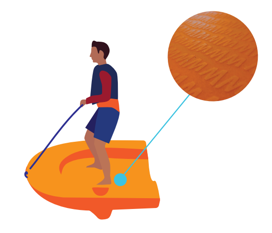
HEELS ON THE SMALL Ws.